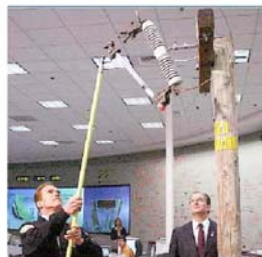
Below: Following the Executive Order signing, Governor Schwarzenegger flipped a ceremonial switch to dedicate the upgrade to the Path 15 transmission line. The upgrade adds a new 500 kilovolt power line to the transmission corridor that links Northern and Southern California.