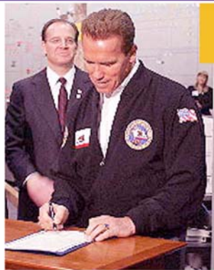
Above: At the California Independent System Operator (Cal ISO) facility in Folsom on December 14, the Governor signed his Green Buildings Executive Order.