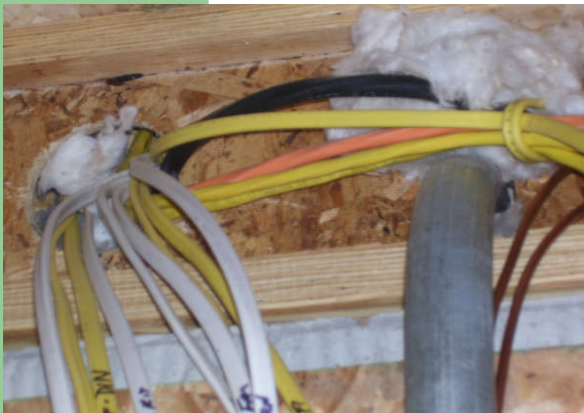
Rim Joist / Return