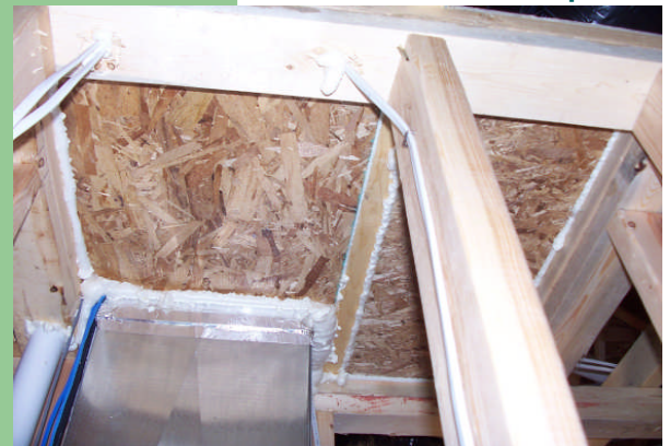
Attic Eave Baffles