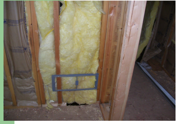
Attic Wire Penetrations